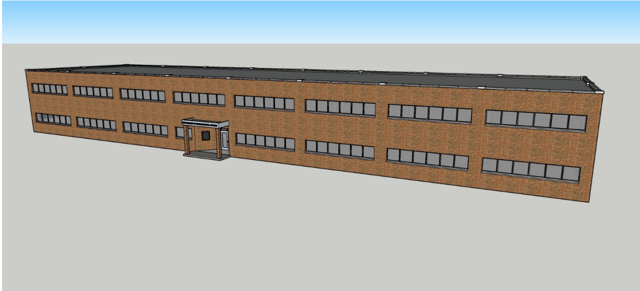
Figure 1 - The Bureaucratic Affairs Building

The purpose of this document is to provide you with a description of the fictitious Bureaucratic Affairs Building, which is located on a college campus in the very beautiful town of Golden Girl, Missouri.